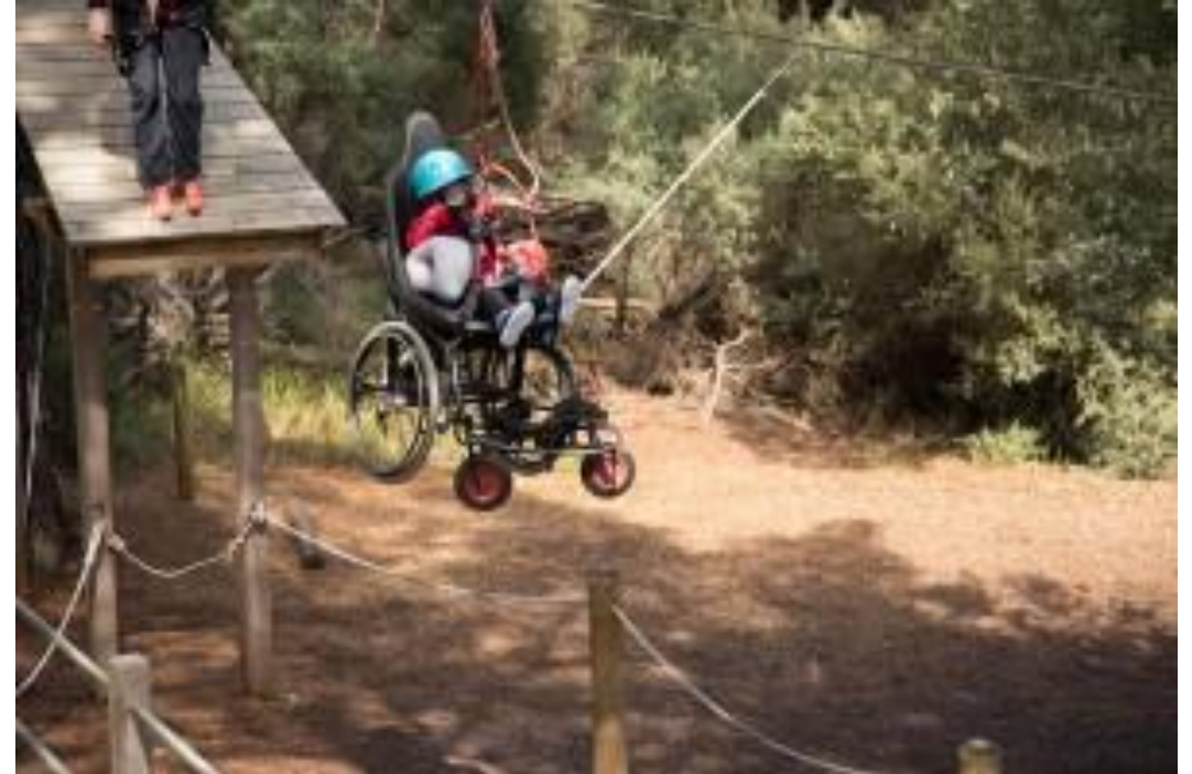
Photo from Camp Manyung in Victoria