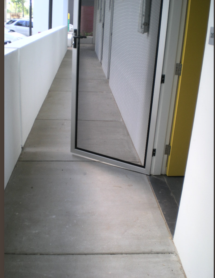
One level entry