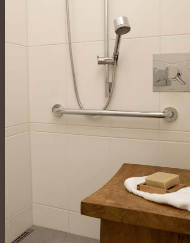
Reinforcement in walls