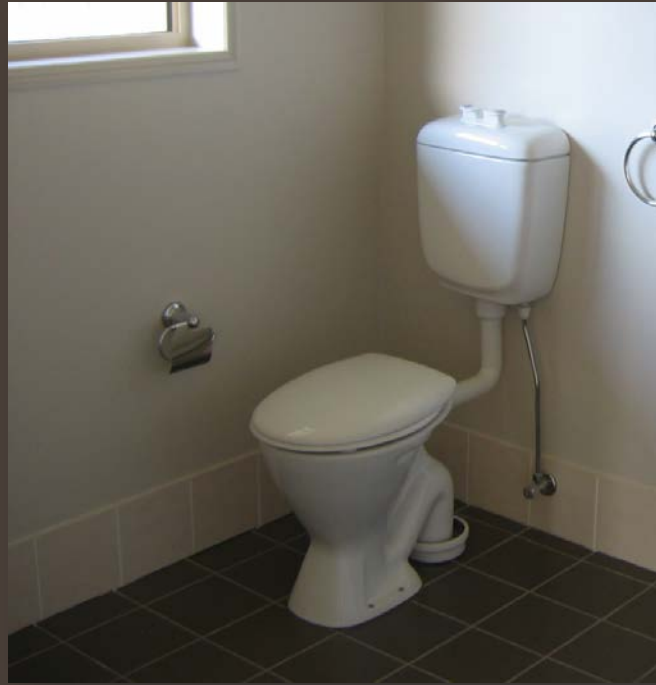
Accessible toilet on entry level