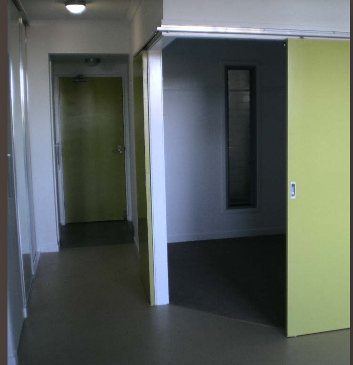
Wider doors and corridors