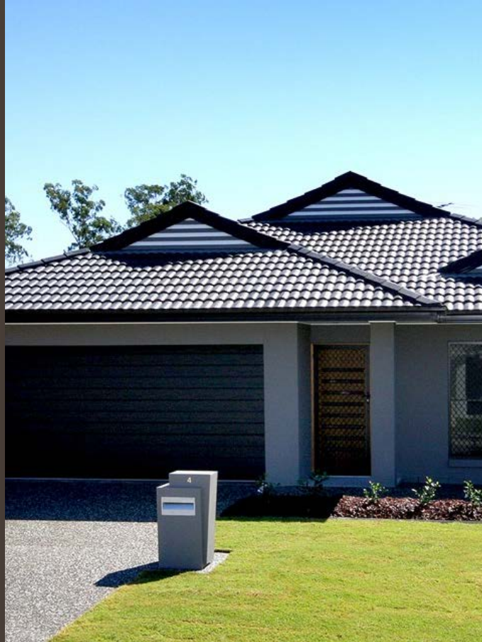
Step-free access to dwelling