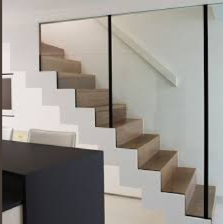
Straight stair against a wall