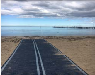
APR 2017 winter testing