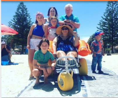
DEC 2016 matting and chair on both beaches