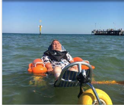
DEC 2016 mobi chair water access