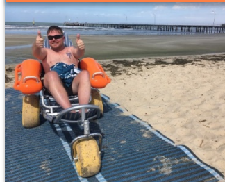
APR 2018 500 days of access