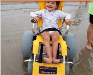
DEC 2017 children's chair