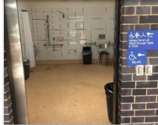
SEPT 2017 accessible changing facility