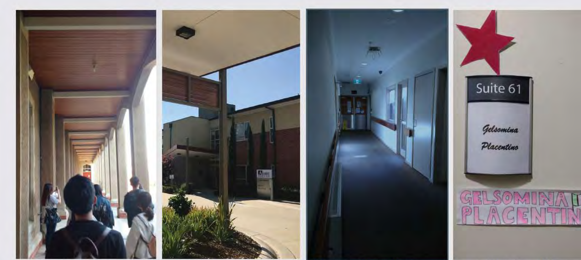
Students walking the eastfacing colonnade. This could be a beautiful courtyard for residents if thought out well enough.